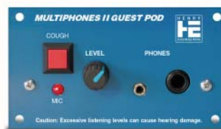
Guest Pod can be mounted in cabinet cut-out