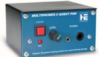
Guest Pod mounted in desk-mount chassis, included